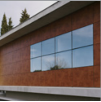
Kelly Residence United States