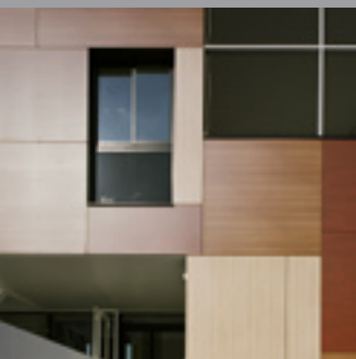
Gourmelen Hospital France