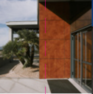
Museum Georges Brassens France