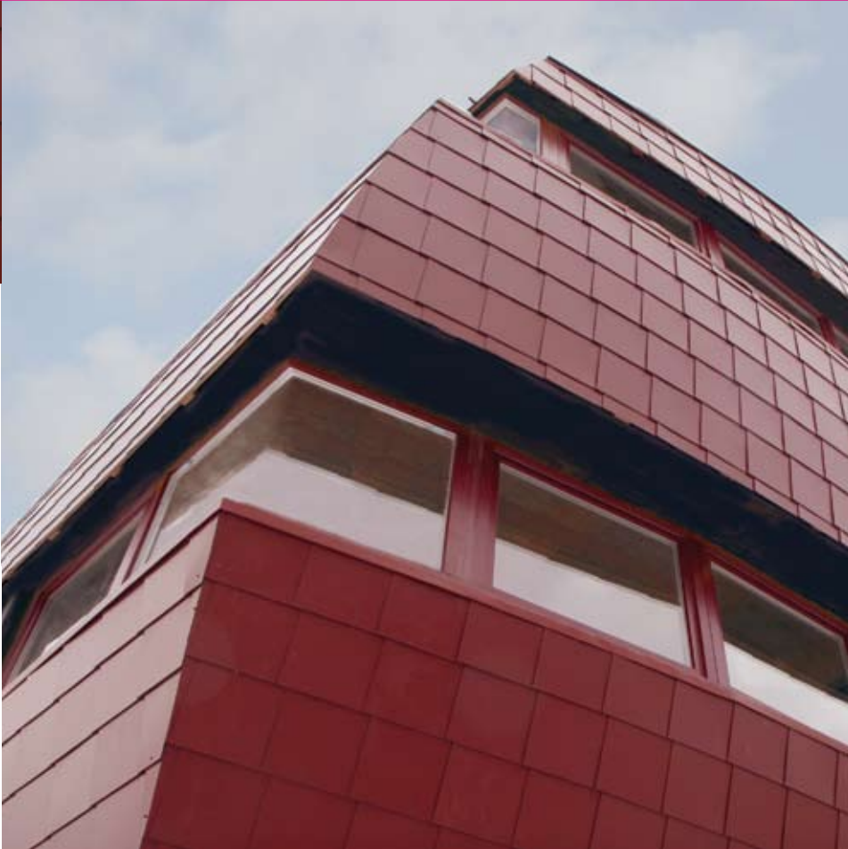
Kanzlei Gerber Austria