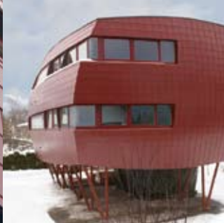
Ecole de musique France