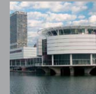
Great Lakes Aquatarium USA

If we have inspired you to think Trespa and you would like to obtain some personal advice or more detailed information, please contact your nearest Trespa office.